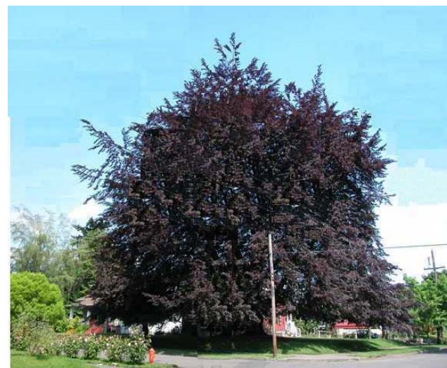
21. Copper Beech

A Self-Guided Tour 7860 S.E. 13th Avenue