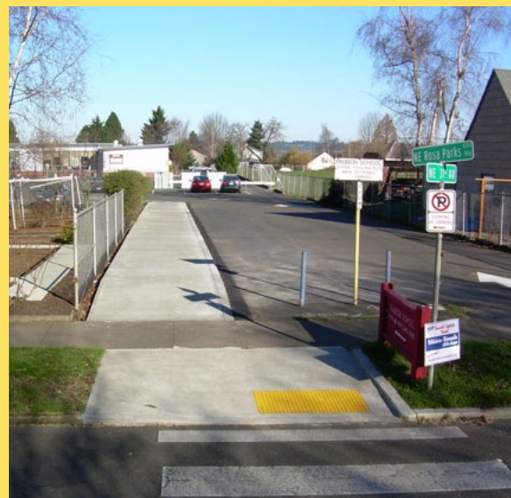
SAFER ACCESS TO SCHOOL!