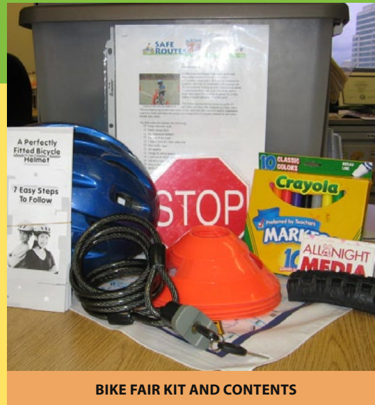
BIKE FAIR KIT AND CONTENTS