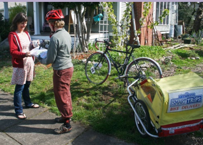
SMARTTRIPS MATERIALS DELIVERED BY BIKE!

You also get a free gift just for ordering. Your child's school will receive $5 for each order form returned by the May 1 deadline. Don't miss out – order today!