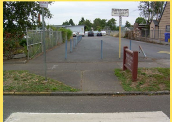
FAUBION ENTRANCE BEFORE