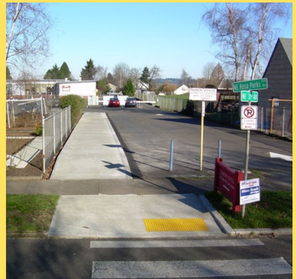
SAFER ACCESS TO SCHOOL!