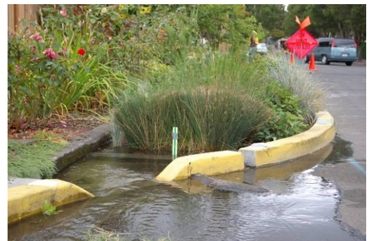
Water entering the south facility during a flow test.

BES conducted a flow test in early 2006 to assess the hydraulic performance of the facilities. Results indicated an infiltration rate of 1.8 inches per hour. Monitoring results were instrumental in identifying necessary design modifications to improve the facilities' function. (See "Successes and Lessons Learned" below.)