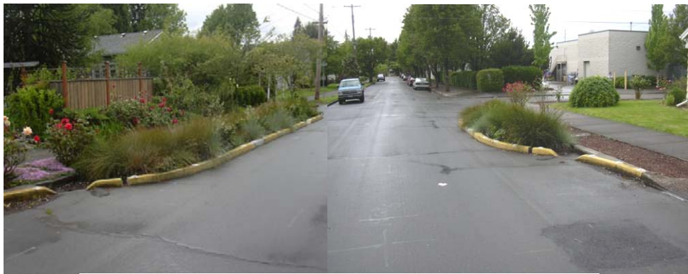
Compilation photo of Ankeny Green Street looking west.