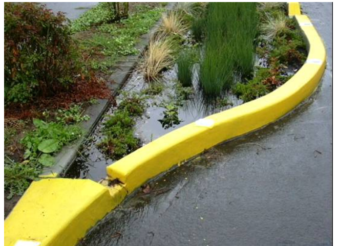
Stormwater retained in North curb extension facility