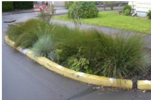
Vigorous growing Juncus patens (dark green plant).