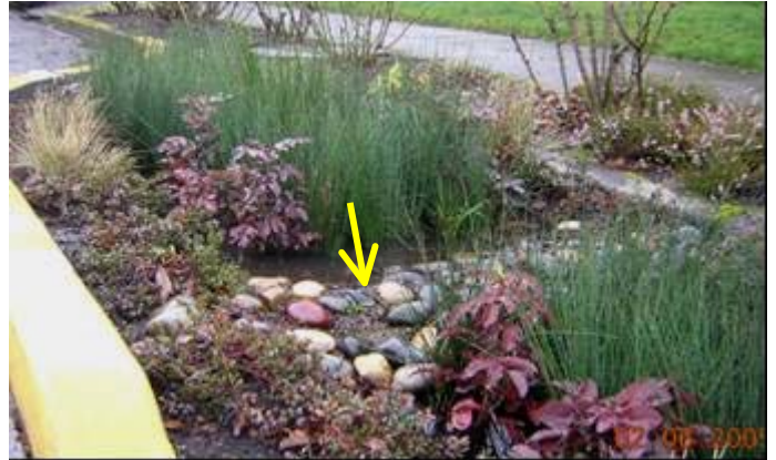
Earthen check dam in South facility