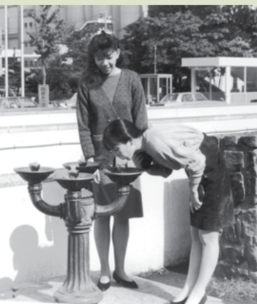
Benson Bubbler in Portland's sister city of Sapporo, Japan

Although most Bubblers were made in local foundries, two Bubblers were made by students at Benson High School. The first student-made Bubbler was installed in front of downtown Portland's Oregon Historical Society and the work is of the highest quality. Visitors can view it for themselves at 1200 SW Park Avenue.