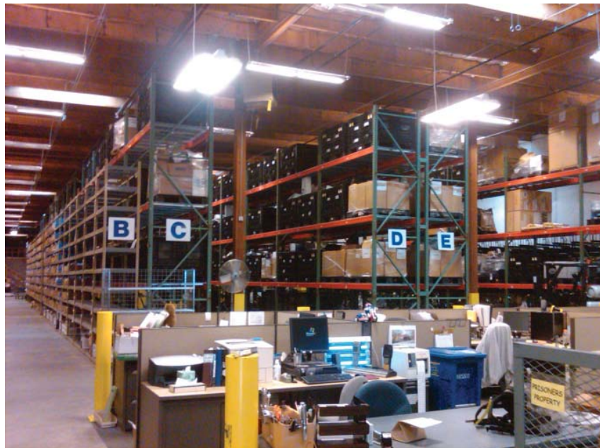
Figure 1 A portion of the PED warehouse storage system

Background The Portland Police Property Evidence Division (PED) is a division of the Police Bureau's Investigations Branch. Its mission is to secure and maintain the integrity of evidence and property for the Bureau and partnering agencies, including Multnomah County and the State of Oregon. PED receives over 50,000 property and evidence items each year and stores over 270,000 items.