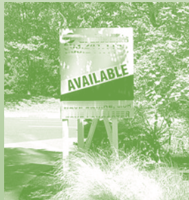
Examples of a properly displayed temporary lawn sign and a temporary freestanding sign

For more detailed information regarding the bureau's hours of operation and available services;