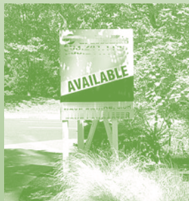
Examples of a properly displayed temporary lawn sign and a temporary freestanding sign

For more detailed information regarding the bureau's hours of operation and available services;