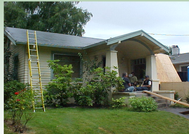
BDS Field Issuance Remodel