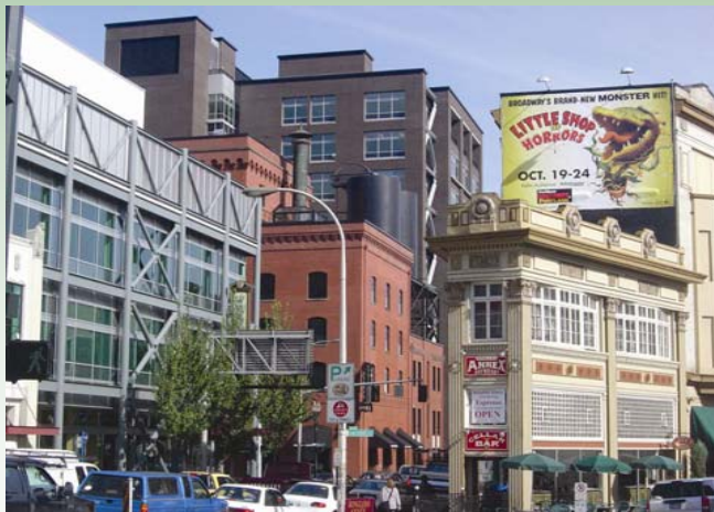
BDS Major Projects Group