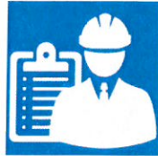
Mobile App for Inspectors