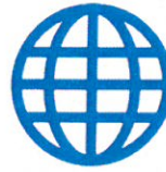
Improved Web Portal for Customers