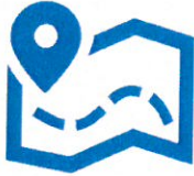
Improved Inspections Scheduling

While the major upgrade and rollout of electronic plan review is underway, POPS is also making improvements to the overall permitting system. These include: