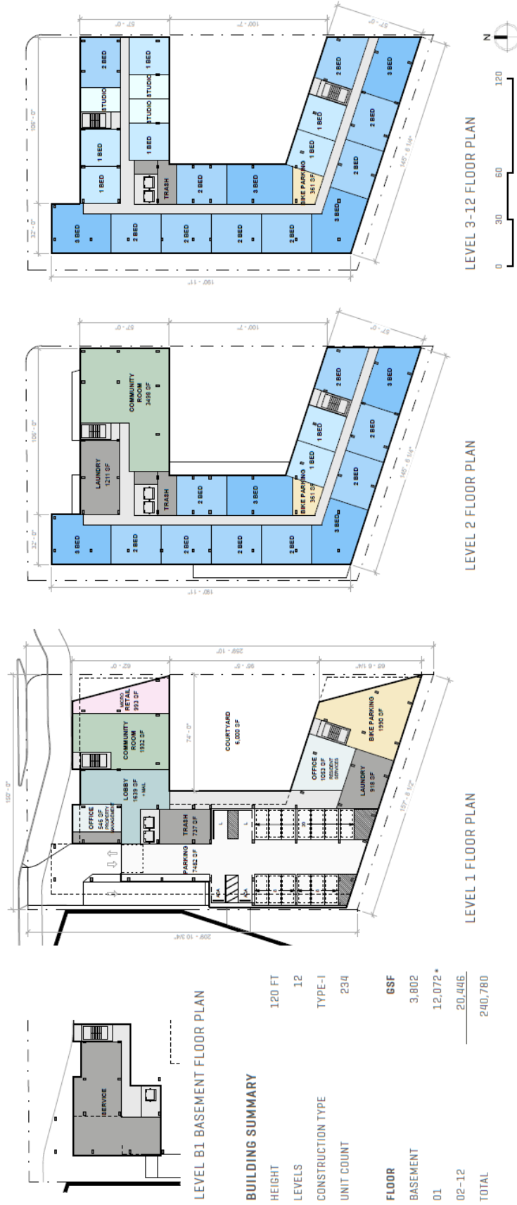
LEVEL B1 BASEMENT FLOOR PLAN