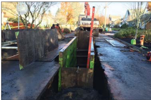
Example of open trench pipe repair in a neighborhood

Trail still open to bikes and pedestrians.