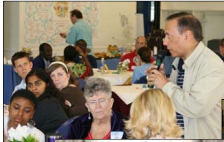
COMMUNITY GATHERING CENTER (Social Portland)