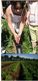
Sauvie Island Center Grow Lunch Garden