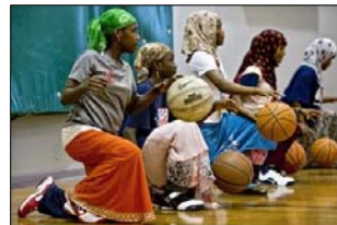
Hosford Middle School African Girls Basketball Team