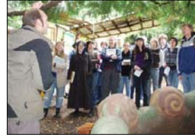
TLC Farm ReCode Portland Project