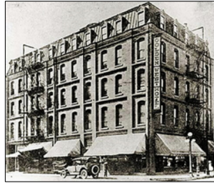
Historical Display Golden West Hotel