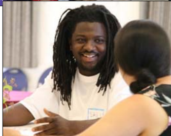
SMALL BUSINESS TECHNICAL ASSISTANCE (Economic Portland)