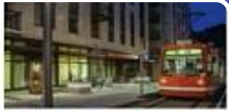
Promoting Opportunity through