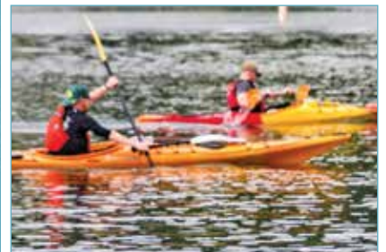
Water-based recreation opportunities abound on the South Reach.

“Enhance the role of the Willamette River South Reach as fish and wildlife habitat, a place to recreate, and as an amenity for riverfront neighborhoods and others”