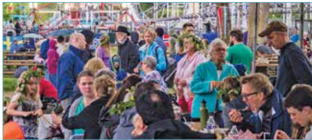
Residents of nearby neighborhoods have easy access to amenities like Oaks Amusement Park.