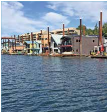
Floating homes and multifamily buildings offer unique housing choices along the South Reach.

The South Reach stands out from other reaches of the Willamette River due to its mix of parks and open spaces, housing types adjacent to and on the river, and commercial uses — all within a short distance from Downtown. The area provides numerous recreational opportunities for communities near and far.