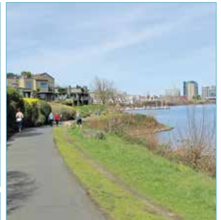
The Willamette Greenway trail was made for runners, walkers, rollers and strollers of all ages and abilities.