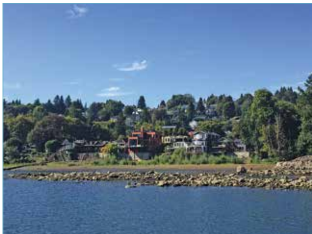
Single-family homes next to the river's edge are common in the South Reach.