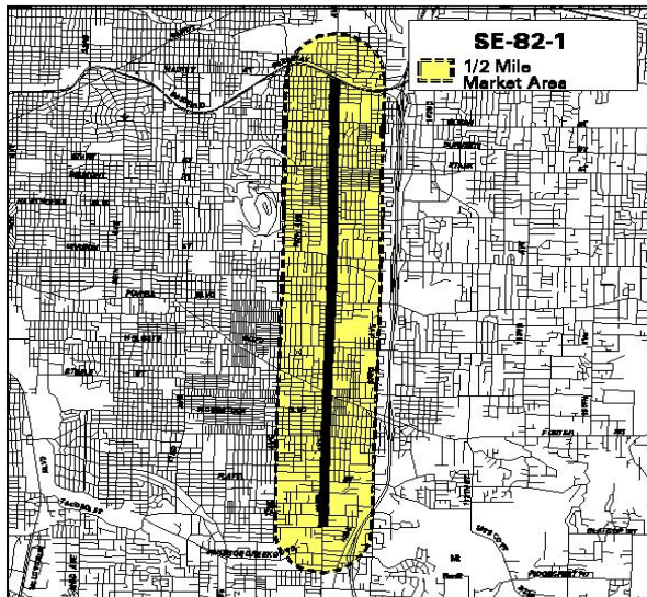
Street Segment and Surrounding 1/2-Mile Market Area

This is a relatively long segment on 82nd Avenue south of I-84. It is designated a main street in the Region 2040 Plan. Compared to a citywide average, this segment's market area has significantly higher people and households per acre; lower than average housing prices and incomes. The segment is slightly more racially diverse than Portland overall, with a 7.6 percent Hispanic population and a 12.1% Asian population. The segment has slightly more children than the Portland average. The area has a higher percentage of large business (20-49 employees) than average, and a similar percentage of small businesses. Retail (40%) is the dominate use; while Auto related sales/service surpass the average in all segments. (27% compared to only 7% for all segments). Zoning in this segment is primarily General Commercial (64%) and Employment (17%).