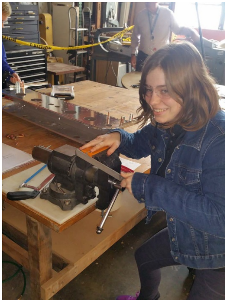
Another youth working on the fuselage section of the RV-12 kit.