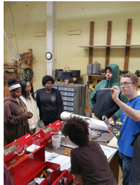
Youth taking part in a demonstration on how to use a hand riveting tool to complete their “OP-51” project