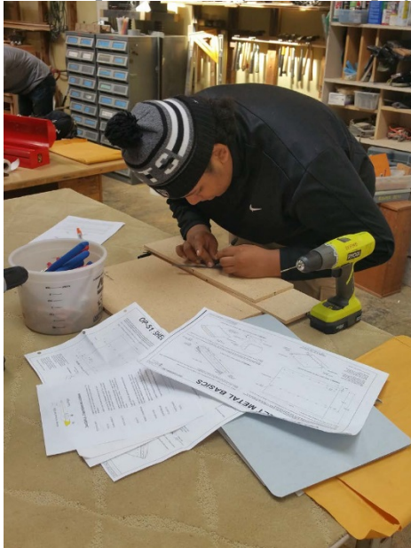
Working on his pre-building project, the “OP-51” aluminum riveting project

Below are candid snapshots of this year's grant project, the purchase of a truck for use by their delivery team.