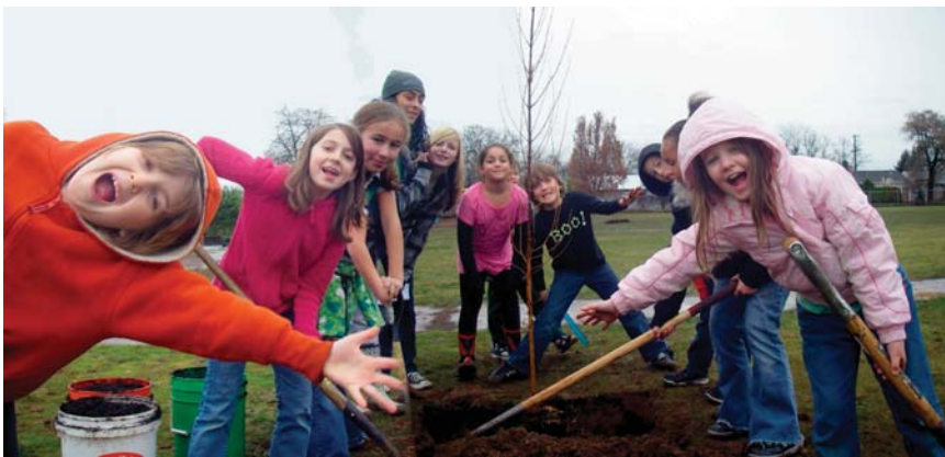
A schoolyard transformed! The Urban Forestry Commission's Communication and Outreach Committee works with Portland Parks and Recreation's City Nature staff to install School Arboreta on school grounds. This transformation at Creative Science School at Clark turned a bleak scene of turf and asphalt into a Learning Landscape with large shade and native trees for the benefit of classes yet to come.