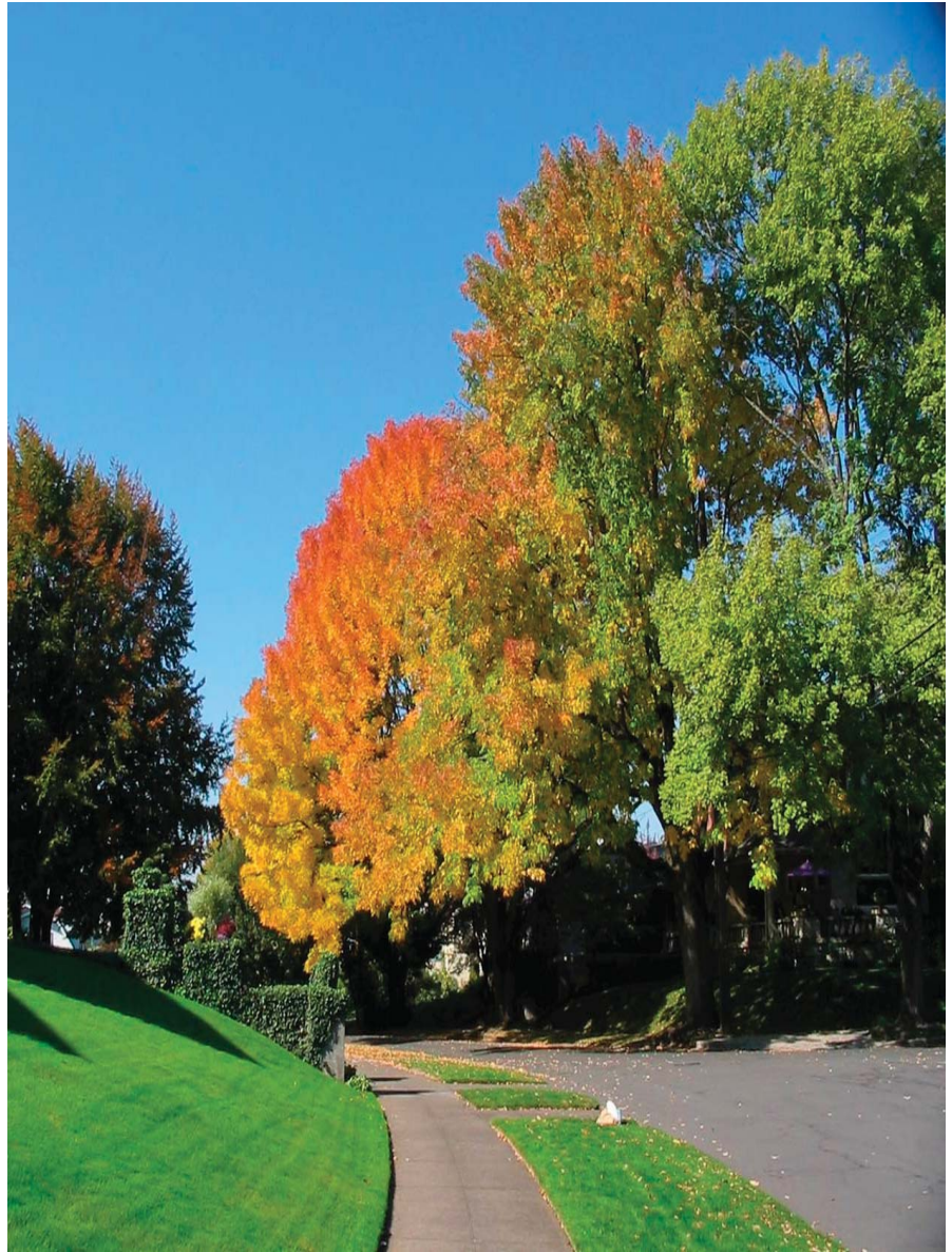
Exhibit A: Urban Forestry Commission 2009 Annual Report