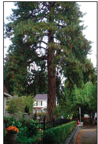
Preserving mature trees, particularly evergreens, is key to protecting canopy within the City.

The impact of the ongoing recession on the City's budget has had an effect on the urban forest with reduced funding for maintenance, staffing, and outreach during the past year. At the same time the inter-bureau team has identified many opportunities for the urban forest to play a major role in accomplishing goals of many of the City's plans, such as the Portland Plan, the Portland Watershed Management Plan, the Portland/Multnomah County Climate Action Plan, and Portland's Urban Migratory Bird Program. To accomplish these goals, in the long run, there will need to be more funds allocated to enhancing and maintaining our urban forest. The issue of the capitalization of trees came up during numerous Commission discussions as a key element in achieving further funding.