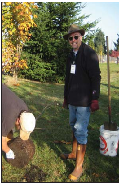
UFC members contributed 1,500 volunteer hours throughout 2009 via committee work, meetings, and events.

Bureau of Environmental Services staff regularly attended and presented at the Commissions meetings and worked with our various committees. The Grey-to-Green Initiative has provided much-needed support for tree planting and the City's education and outreach efforts to assure that there is community support not only for planting trees, but for nurturing to maturity these growing parts of our infrastructure.