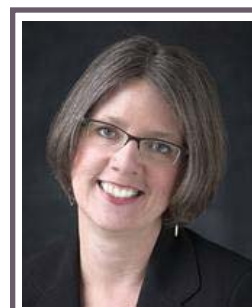
City Auditor LaVonne Griffin-Valade

Three complainants agreed to mediate their complaints. Two cases were successfully mediated. The third case was referred to IAD with a recommendation to conduct an investigation rather than proceed with mediation.