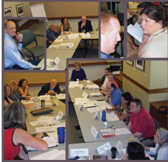
The City Auditor, IPR staff members, CRC members, and Portland Police Bureau staff members (along with Portland community members, other interest groups, and City representatives) participated in several Police Oversight Stakeholder Committee meetings in the 2010 third quarter.