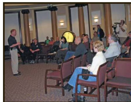
Citizen Review Committee and Police Review Board training was presented by the Portland Police Bureau in the City Hall Council Chambers – six evening public sessions.

IPR had six mediation requests in the fourth quarter: three cases were completed through mediation sessions. However, the complainant withdrew in the fourth case and the detective declined to mediate in the fifth case. Due to scheduling issues during the holidays, the sixth case is to be mediated in the first quarter of 2011. Also, two requests were carried over from the third quarter: one was mediated and the other was cancelled by the complainant. Eight cases were processed for mediation in this quarter.