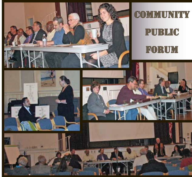
CRC's Community Public Forum on Portland Police Bureau accountability and professional standards – October 28, 2010 at Keizer Permanente's Town Hall on North Interstate Avenue, Portland, Oregon.