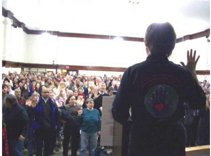
This hand, above, forms a wall of hands put up in 2003 and is now a permanent part of the wall at Southeast Uplift. At right, more than 1,000 people joined to take the Hands & Words Are Not For Hurting Pledge in January 2005 at the Unity Rally, organized in response to skinhead activity in SW Portland.