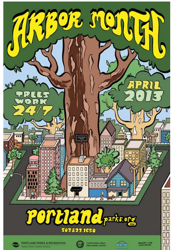
Right: Portland's 2013 Arbor Month Poster

The goal for Arbor Month is to celebrate Portland's beautiful urban forest while encouraging citizens to discover Portland's nearly 300 Heritage Trees and learn how Portland's trees work 24/7: filtering our water, cleaning our air, cooling the city, providing wildlife habitat, enhancing livability, and increasing property resale value. For a detailed schedule of events please visit www.portlandoregon.gov/parks/arbormonth .