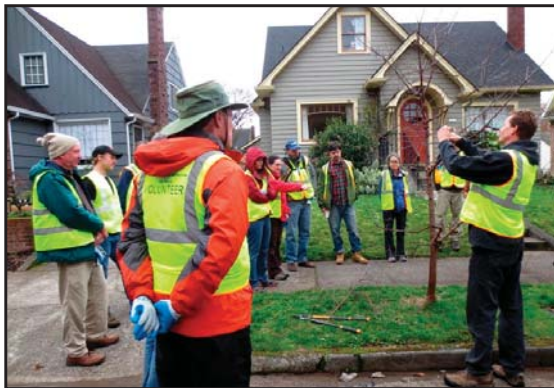
HAND Tree Team members pruning young trees for structure and clearance in 2014.

After analyzing the results, the Hosford-Abernethy Tree Team created a vision statement, set goals, created objectives, and made property owner recommendations designed to improve the health of the community's urban forest. The result is the Hosford-Abernethy Tree Plan, which will guide the team's stewardship activities in future years.