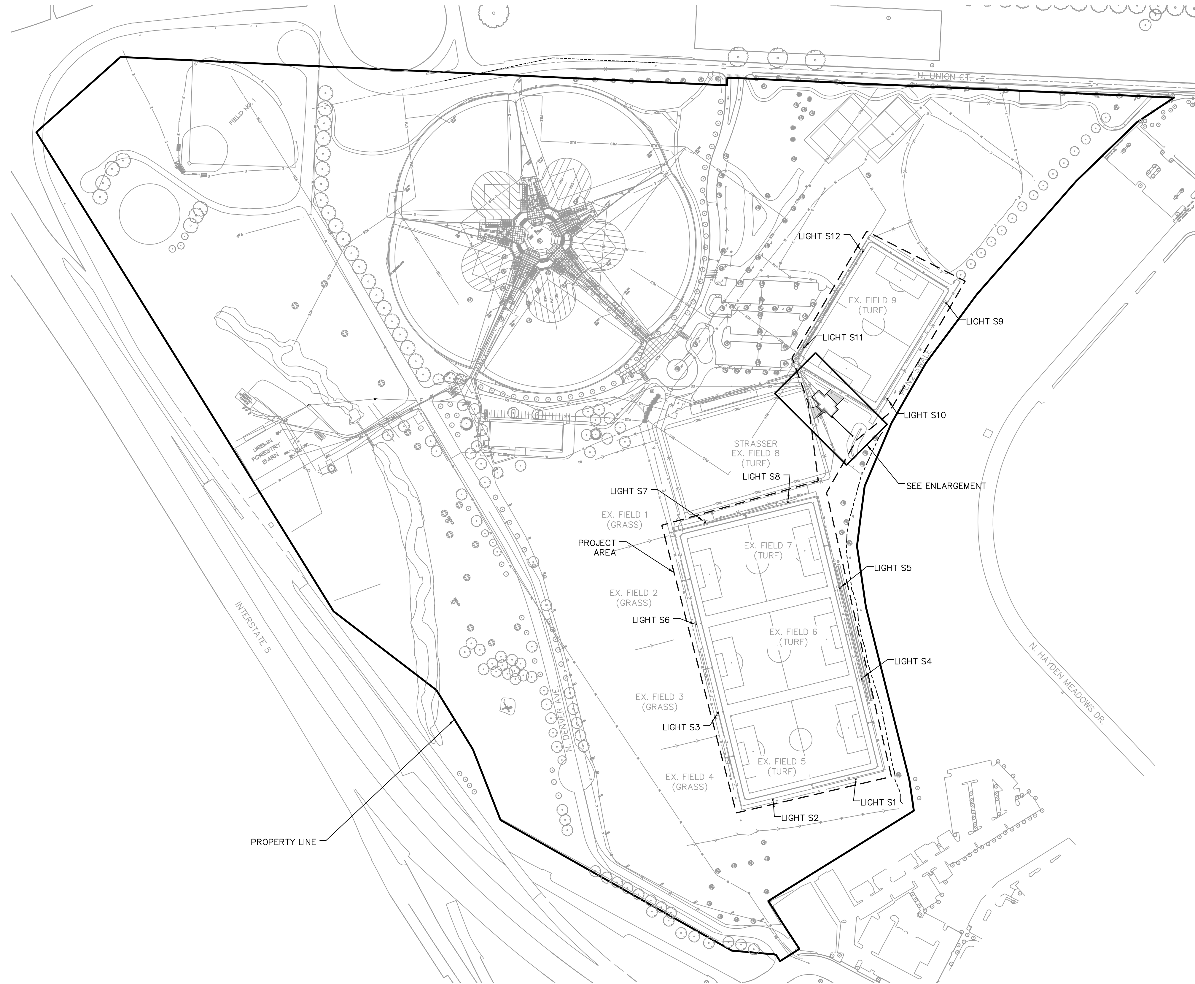
SITE PLAN SCALE: 1" = 150'