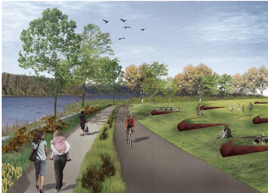
Above, an illustration from the 2012 permit application. Looking south from near Whittaker: Pedestrian path at left, bike path at center and Lawn Shelves at right.

JW Fowler will also begin working on the Viewing Terraces and Pathways adjacent to the bases of the Meriwether and the Atwater. Some rebuilding of the existing paver pathways is needed in order to evenly match the new improvements, and this may require closing the existing walkway for short periods of time. We will minimize the amount of time this will take and work with the South Waterfront Community Association to provide as much advance notice as possible of when the work will happen.