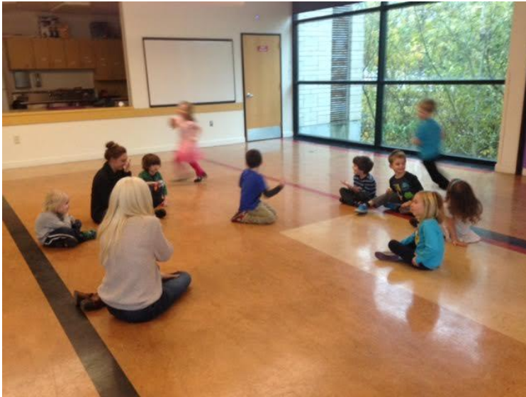
“Duck, Duck, Goose”