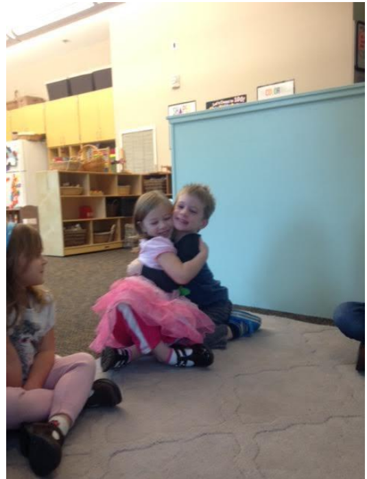
Handshake, Hug, or Highfive?