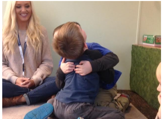
The “Balance Boogey”