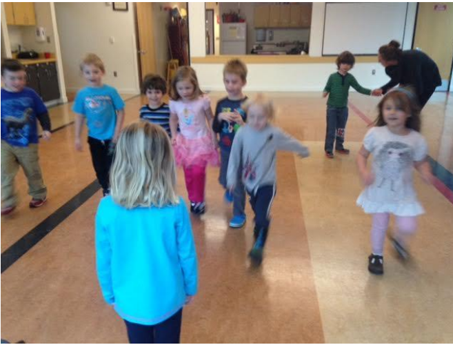
What time is it Mr. Fox?!