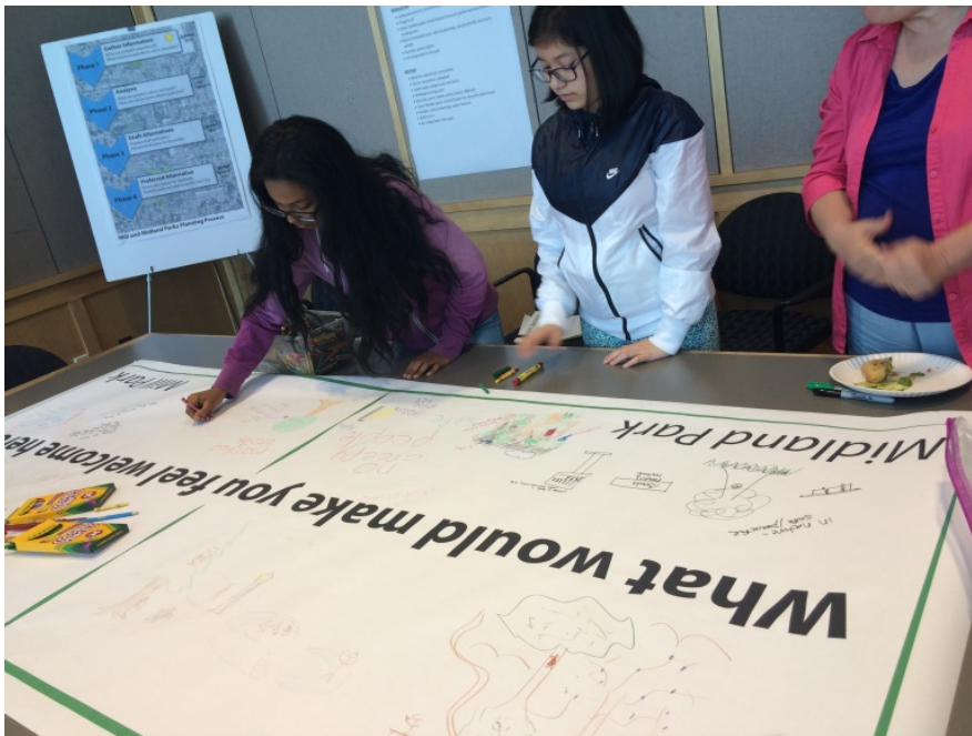
Community Representative Committee members participate in the visioning exercise, drawing and writing answers to the question, “What would make you feel welcome here?” for both Mill Park and Midland Park.