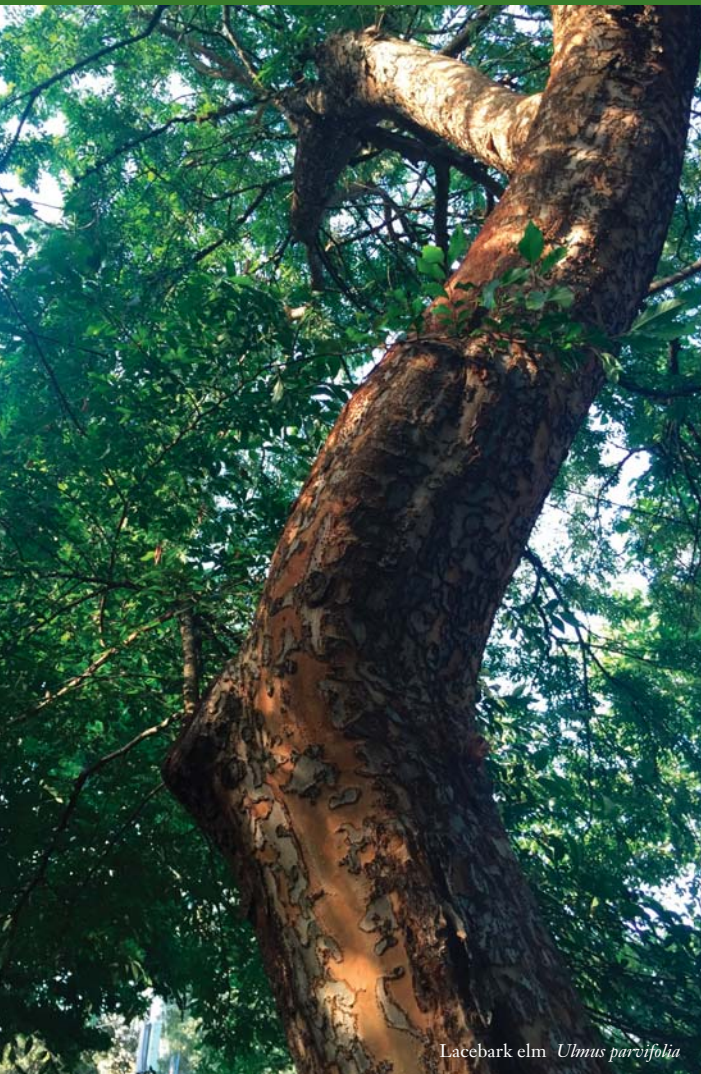
Lacebark elm Ulmus parvifolia