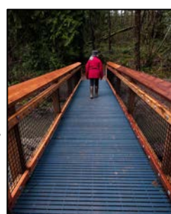
April Hill

ADDITIONAL INVESTMENTS—~$1.25M to be invested in Southwest Community Center roof repair/solar photovoltaic system. Details TBD. Friends of Portland Community Gardens invested ~$30K in Crossroads Community Garden (2016).