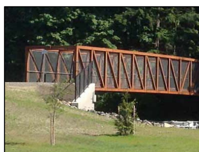
Pier/Chimney Park Bridge