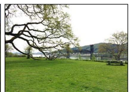
Open Meadow Property Acquisition