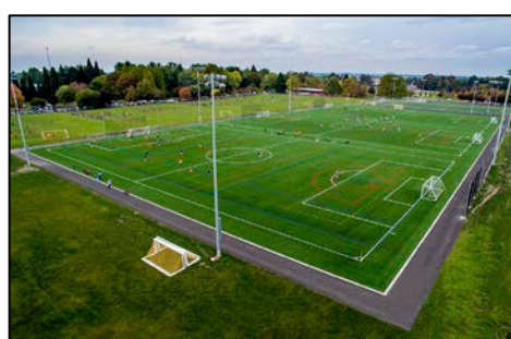
Improvements at Delta Park