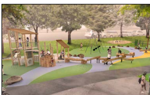
Kenton Park Playground Plans