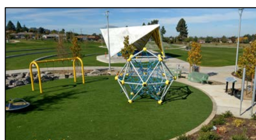
New Park: Luuwit View Park

ADDITIONAL BOND INVESTMENTS PLANNED—DETAILS TBD ($3.1M total in addition to $55M above): The 2014 Parks Replacement Bond will also fund: full playground renovation at Gilbert Primary Park; new play pieces at Argay, Bloomington, Knott & Wilkes Parks; ADA Improvements at EPCC; bridge repair-Springwater; Loo at Raymond Park.