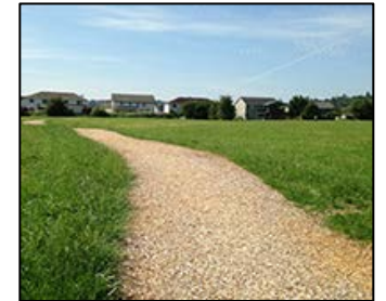
New trail: Clatsop Butte N.A.