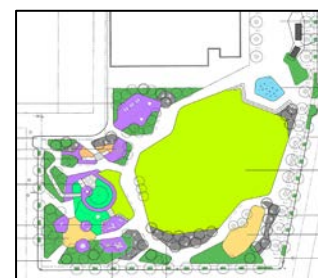
Design: Gateway Discovery Park