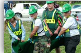
Figure 1: CERT training, FEMA.