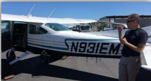
Figure 2: Clackamas County's MAST plane and pilot - June 2017