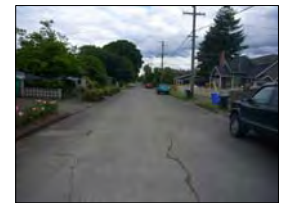
SE 58 th Ave north of Mitchell St