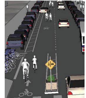
B. Shared left-side bikeway and turn lane