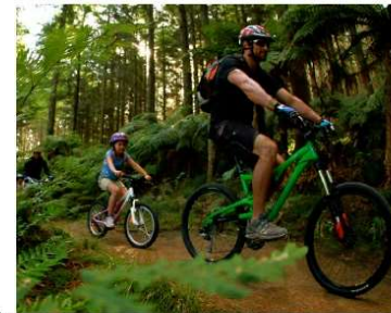
Examples of natural trails