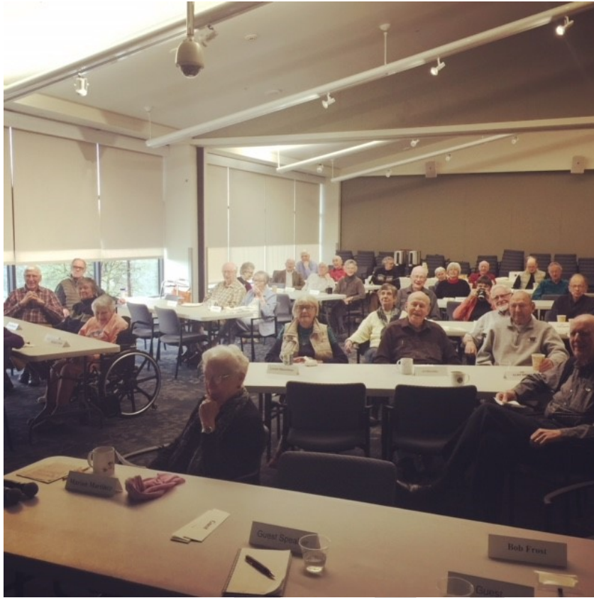
Figure 6: Terwilliger Plaza residents participating in their focus group.