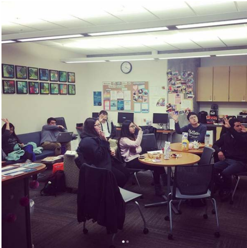
Figure 4: PCC international students participate in SWIM prioritization activity during Conversation Café.