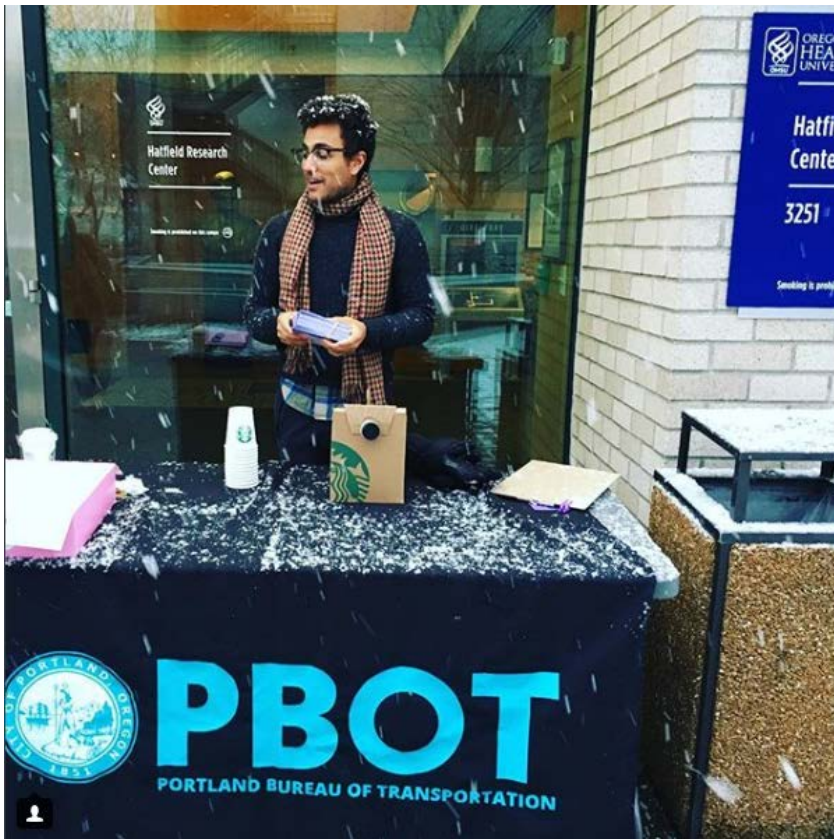
Figure 3: Staff tabling at OHSU campus in the snow.