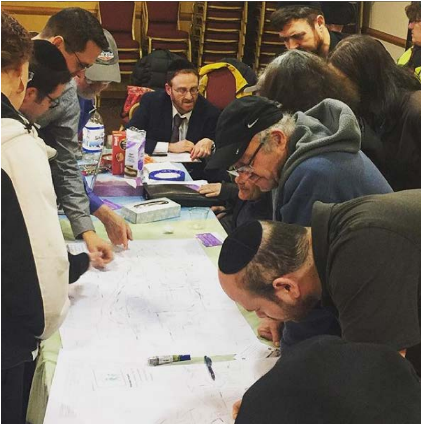
Figure 2: Kesser Israel focus group (participants look at maps to identify walking and biking needs).