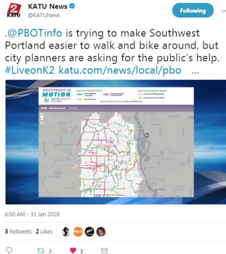
Figure 1: Screenshot of a KATU tweet, featuring an image of the online survey.