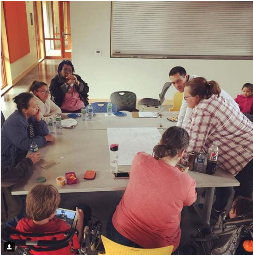
Figure 5: Residents of Stephens Creek Crossing engage in a SWIM focus group.

http://www.homeforward.org/find-a-home/get-an-apartment/stephens-creek-crossing