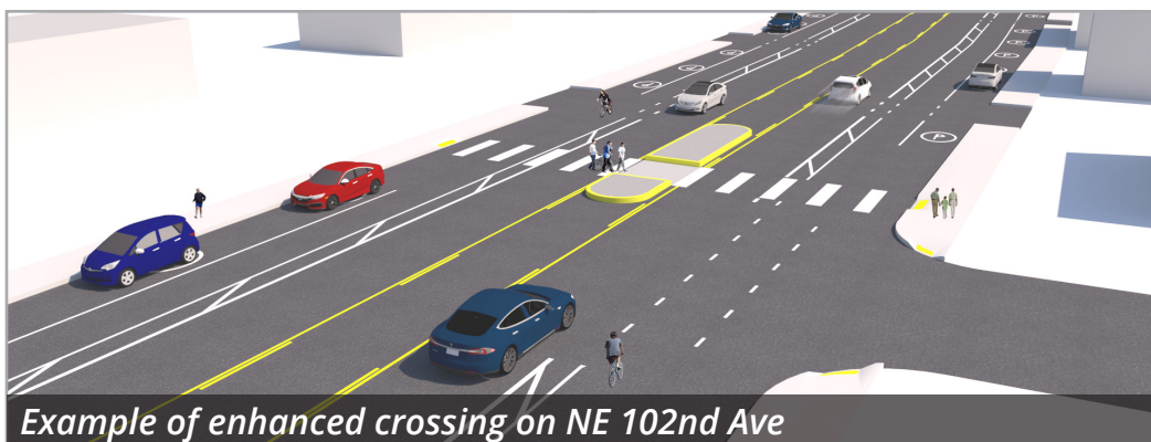
Example of enhanced crossing on NE 102nd Ave

Learn more at www.portlandoregon.gov/transportation/NE102nd