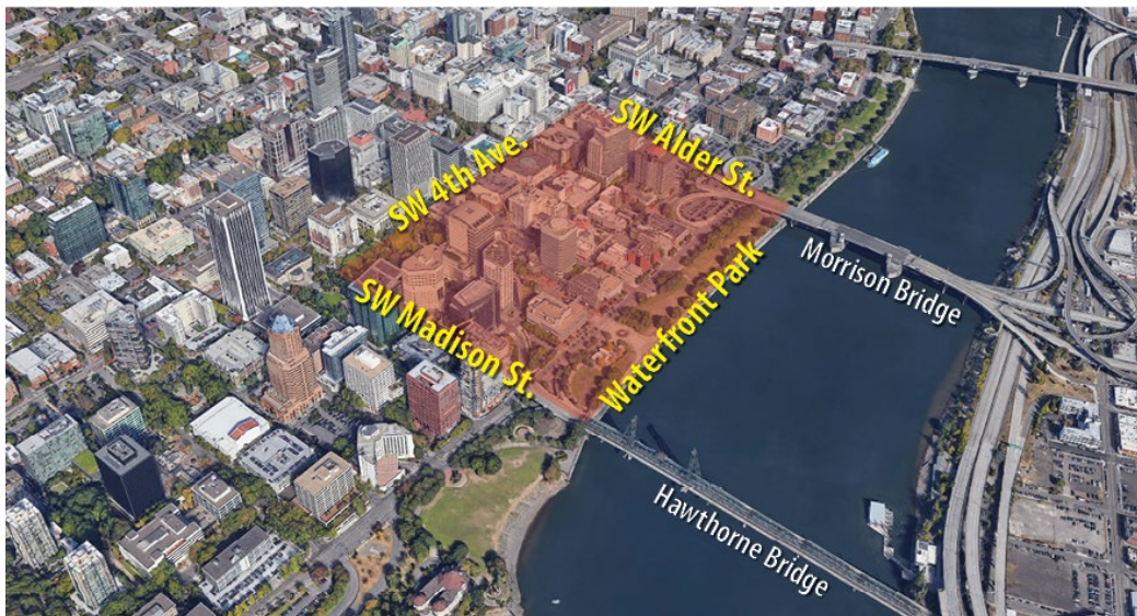
Mapa provisto por el Departamento de Policía de Portland (Portland Police Bureau). En la imagen se ve un mapa del Centro de Portland.

Consulte trimet.org/alerts antes de viajar en transporte público o inscríbese en el servicio informativo de TriMet en trimet.org/email para recibir alertas por correo electrónico o mensaje de texto. Si la policía determina que un área se torna peligrosa, TriMet modificará su servicio por la seguridad de los pasajeros y los empleados.