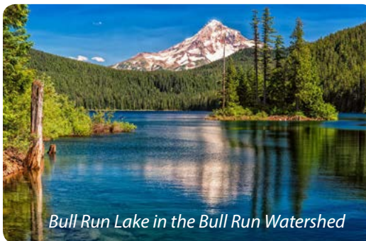
Bull Run Lake in the Bull Run Watershed

As a steward of the city's drinking water, the Portland Water Bureau (PWB) carefully monitors water levels, weather forecasts, and water-use patterns to ensure there is plenty of clean water for all customers. Every year, PWB plans for summer supply to determine the best use of Portland's water resources. For information about summer supply, visit www.portlandoregon.gov/water/summersupplyplan .