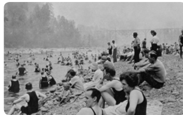
The beach at Dodge Park circa 1926

www.portlandoregon.gov/water/dodgepark .