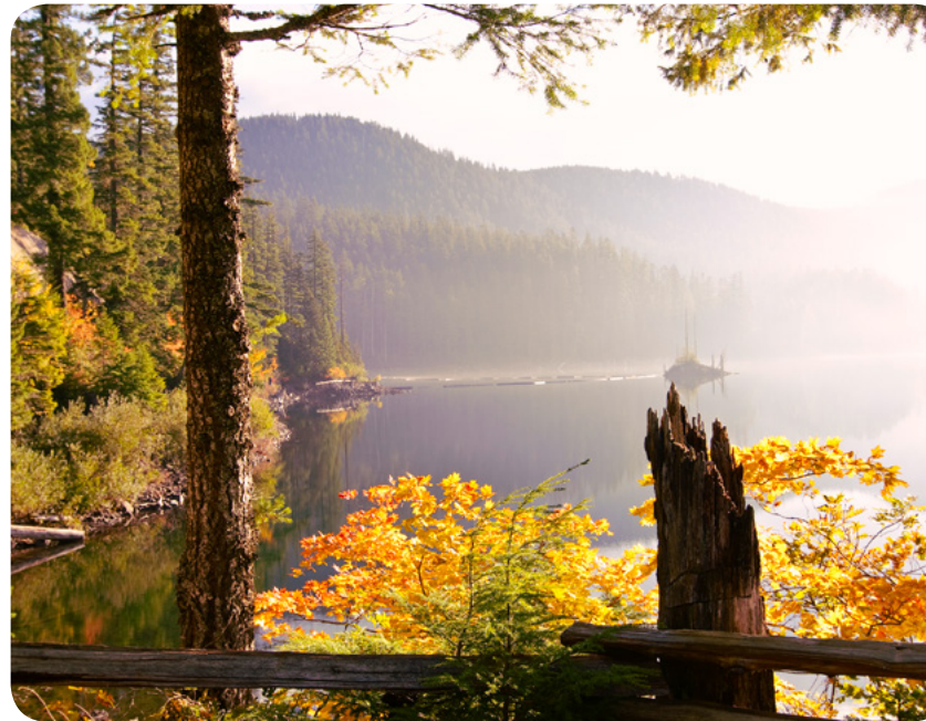
Bull Run Lake, headwaters of the Bull Run River