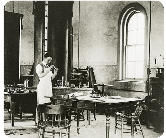
A lab technician in Portland's early days

Water treatment adapts to changes in science, technology, and water quality, and the City of Portland continues to adapt. In August, Portland City Council voted unanimously to build a water filtration plant. Scientists and engineers are also studying ways to further reduce the chance of lead exposure from home plumbing.